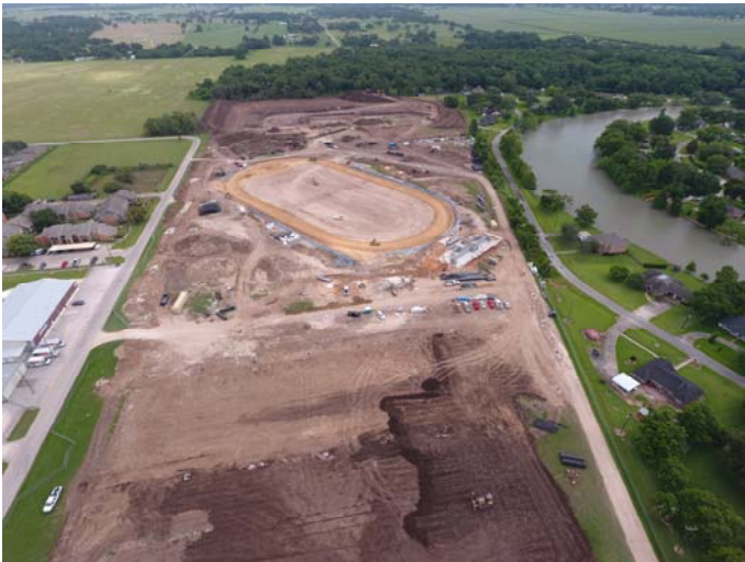
21. Overall site development