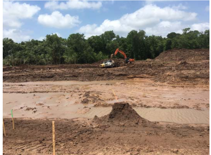
14. Detention area excavation