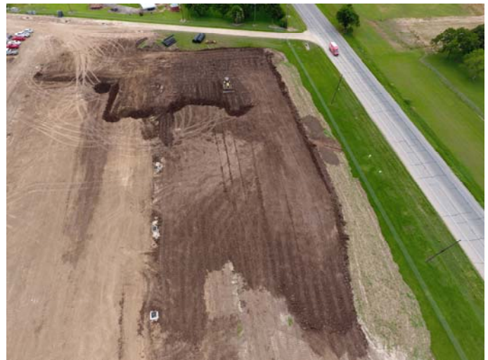
20. Rough grade at home parking area