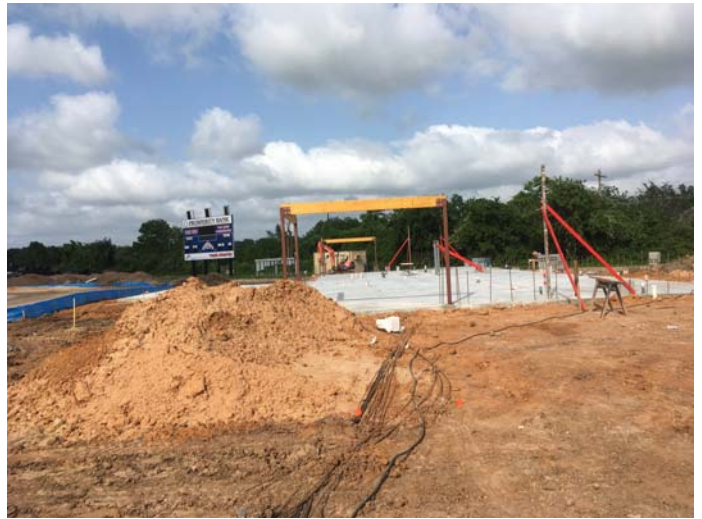
10. Structural steel at concessions