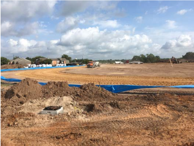
19. Limestone base at track