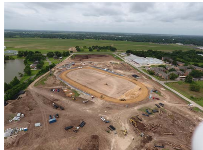
24. Limestone base at track