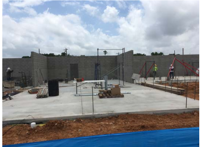
16. Interior masonry partitions at concessions