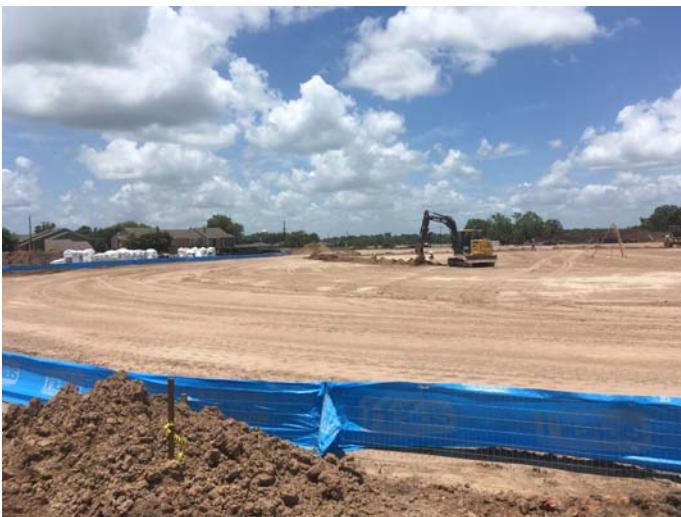
17. Stabilization of track