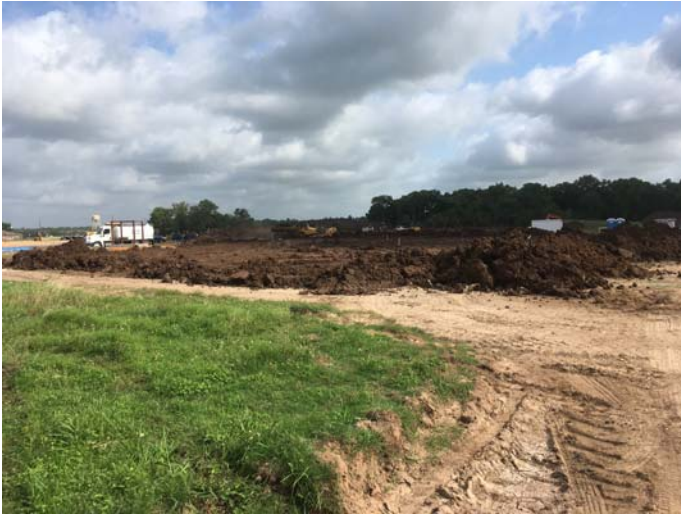
13. Import of fill and visitor parking