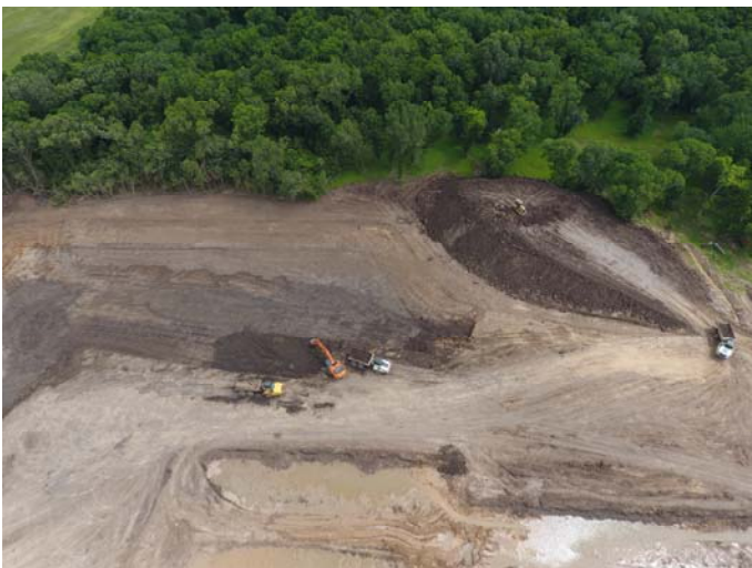
23. Detention area excavation