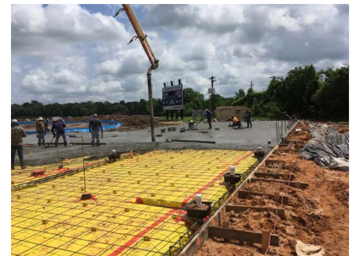
6. Concrete slab on grade at concessions