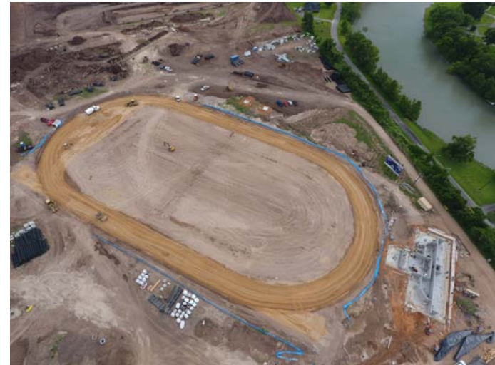
22. Site development at field and common area