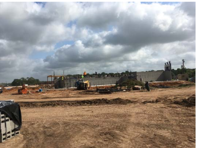
12. Interior masonry at concessions