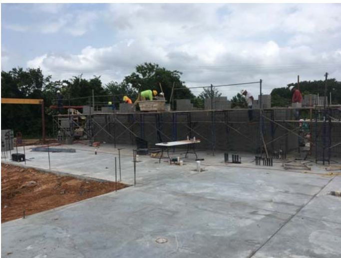
11. Interior masonry at concessions