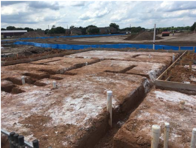
1. Grade beam excavation at concessions