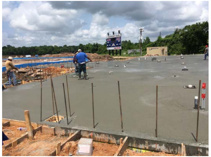
8. Concrete finishing at slab on grade