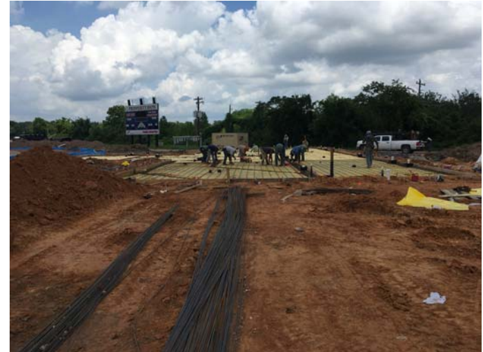
4. Slab on grade reinforcing steel