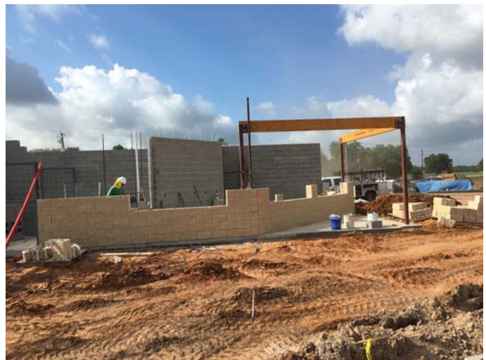
18. Exterior masonry at concessions