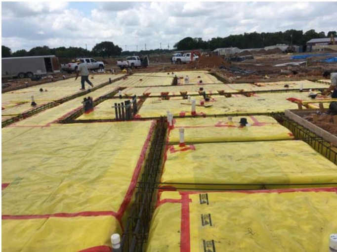
3. Grade beam reinforcement at concessions