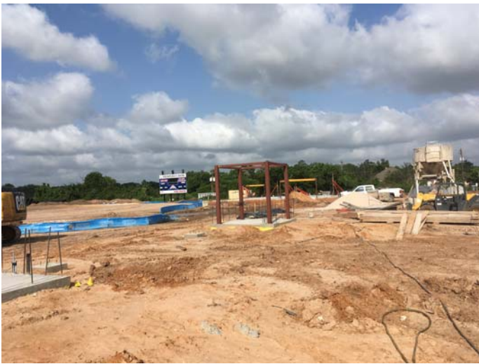
9. Structural steel at entry pavilion