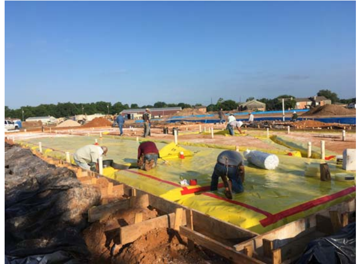
2. Vapor barrier installation at concessions