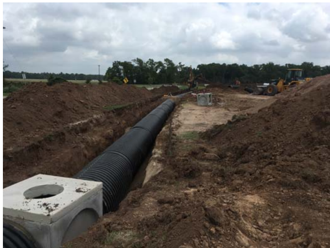
15. Storm sewer at visitor parking